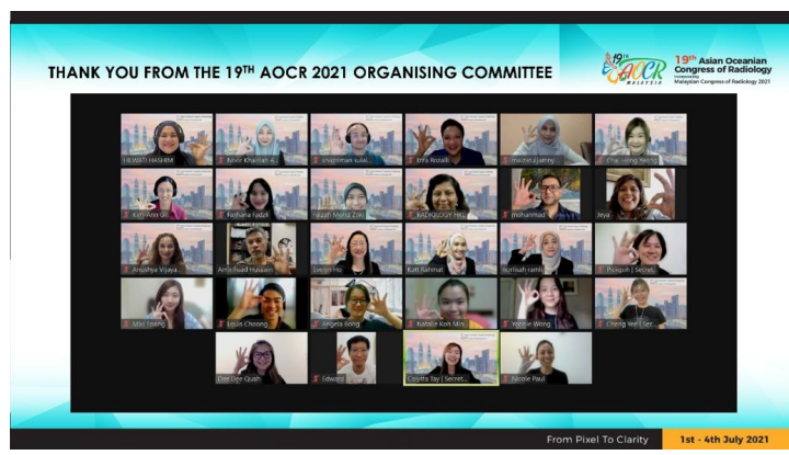
Thank you from the Organising Committee of the 19th ACOR 2021.

All in all, the 19<sup>th</sup> AOCR Congress 2021 was a huge success despite the many challenges and setbacks that the local host and organising committee encountered.