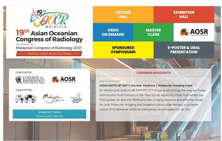
Virtual congress platform.

Malaysia successfully hosted the 19<sup>th</sup> Asian Oceanian Congress of Radiology 2021 (also referred to as the 19<sup>th</sup> AOCR 2021) on the 1<sup>st</sup> to 4<sup>th</sup> July 2021. This event was held in conjunction with the Malaysian Congress of Radiology 2021. Despite the challenges of the pandemic lock down and travel restrictions due to COVID-19 pandemic, the congress took place successfully as a virtual congress.