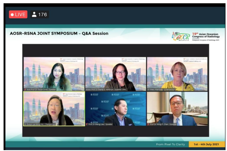
AOSR-RSNA Joint Symposium.

The organisers thanked the industry for their full support. Some notable support by the sponsors include the following:-